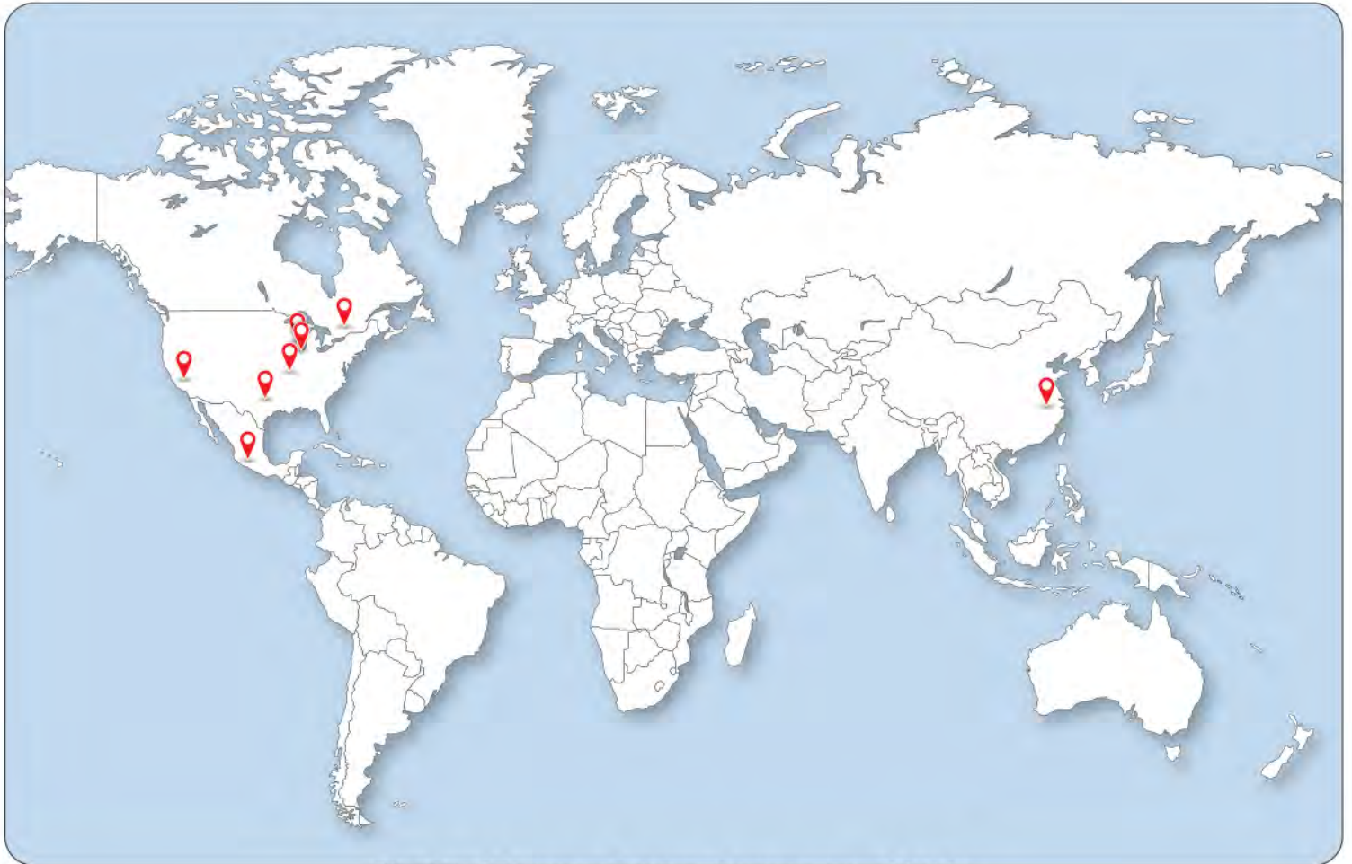
The Gund Company Services Customers worldwide